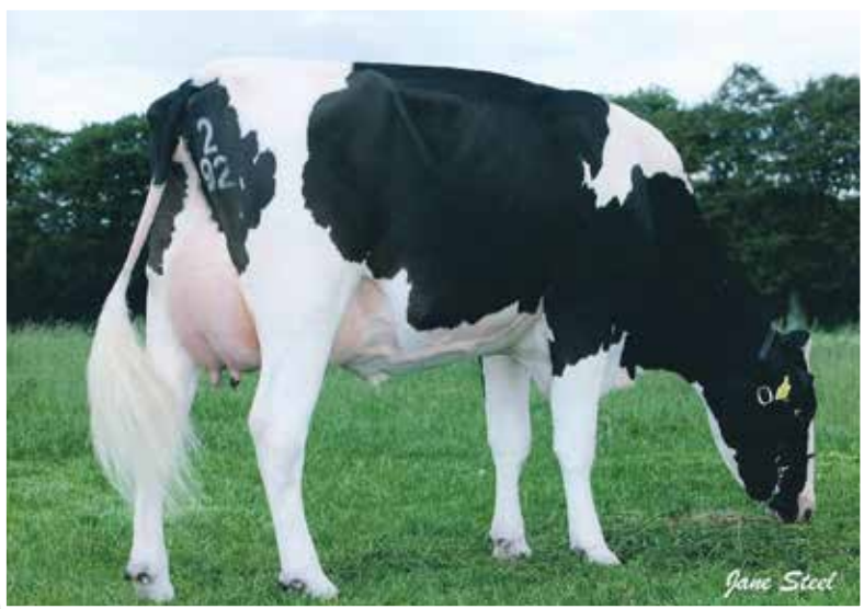
HETHERSGILL LHEROS SQUAW EX90 6* 3.d. of Lot 52