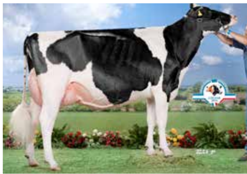
RIVERDANE SVS ATLEE VG*( SP LP70 12* g.d. of Lot 46