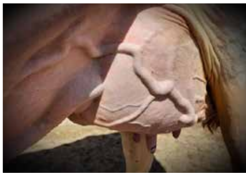
RIVERDANE DM ATLEE VG88 dam. of Lot 46