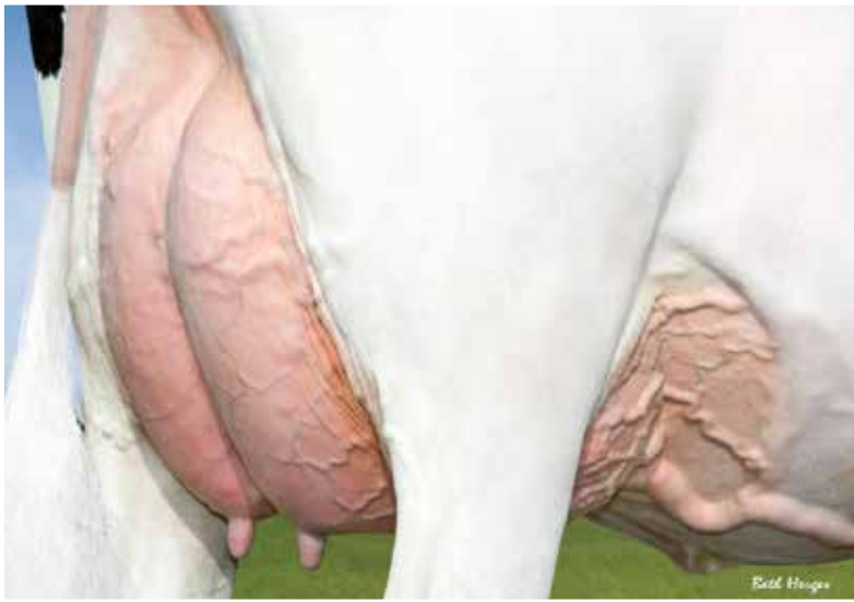
SANDY-VALLEY MG AMARETTO VG87 Dam to Lot 20