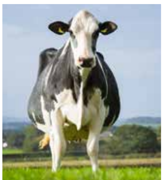
WARNELVIEW FINAL CUT NITA EX97-7E SP LP120 12* g.d. of Lot 44A