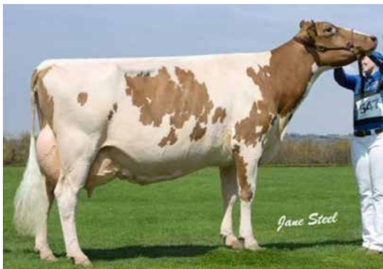
MARLEYCOTE SEA LILY 14 EX94-2E 1* Gdam of Lot 2