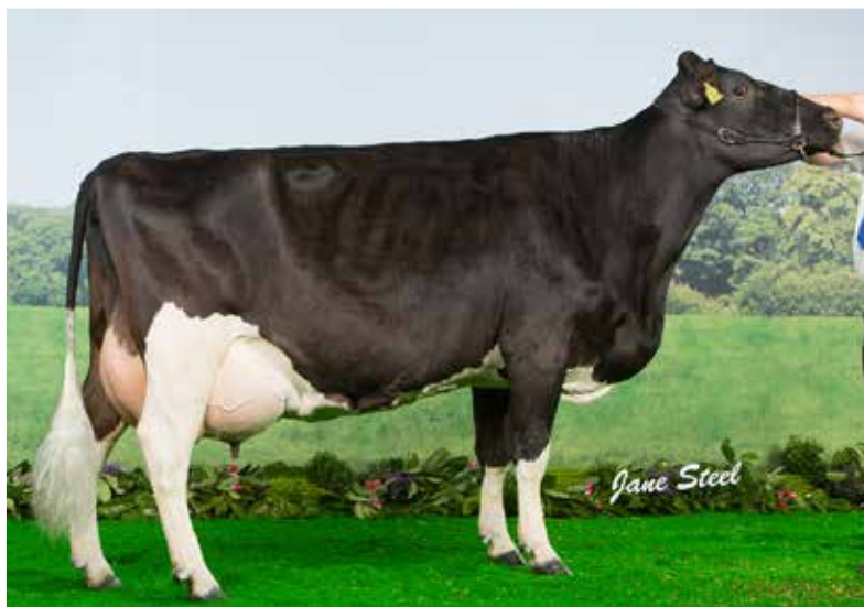
LISMULLIGAN PRISCILLA 41 BFE94-7E SP LP60 3.d. of Lot 45