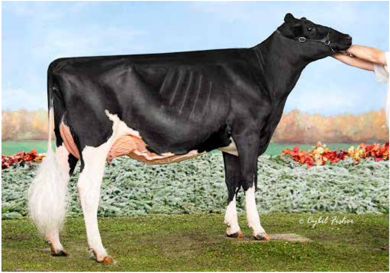
BUDJON VAIL SOLMN APACHE VG89 dam. of Lot 47