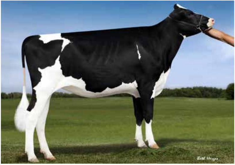
MS SOFIAS DELTA SPIRIT Dam of Lot 15