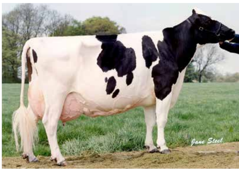
STARDALE STARBUCK STELLA EX96-7E SP LP80 RM 30* 4.d. of Lot 27