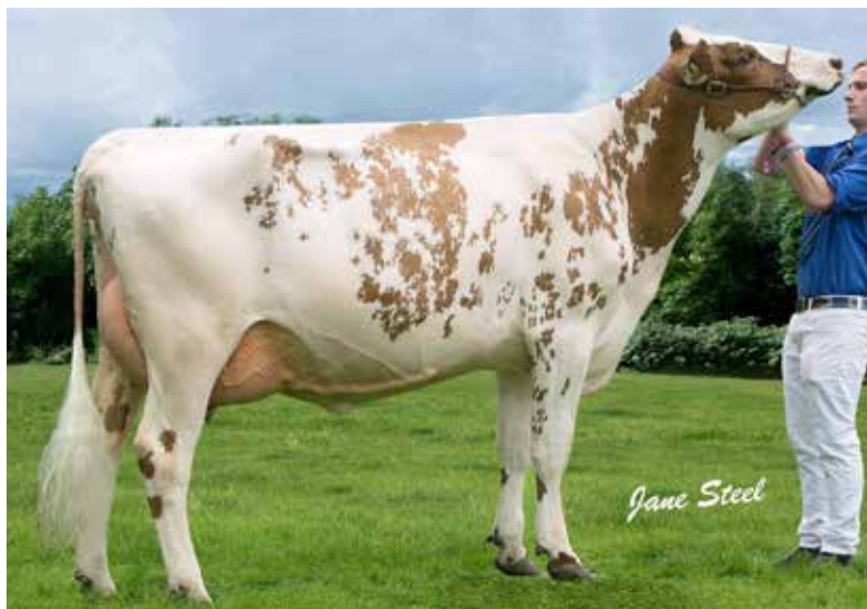
MORWICK RUTH 158 EX92

1 02/11 7388 3.67 3.33 305 2 04/01 8960 3.94 3.44 305