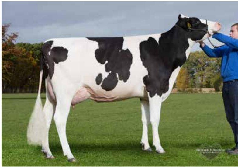
ORTONGRANGE ATLANTIC ROXY EX91-3E SP LP60 3*