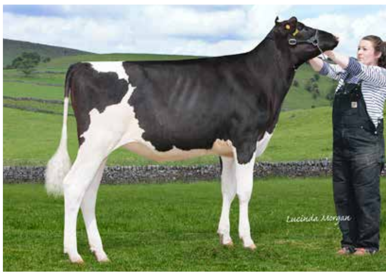
STERNDALE GAIN CHLOY VG86 (2YR) SP Dam to Lot 24