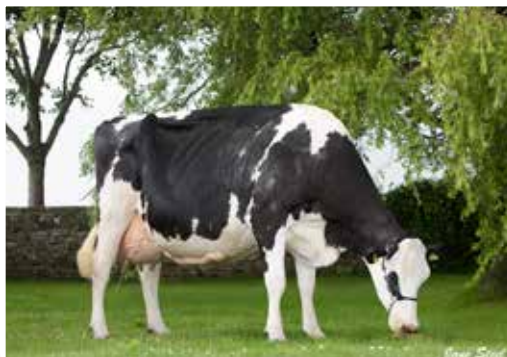
WARNELVIEW FINAL CUT NITA EX97-7E SP LP120 12* g.d. of Lot 44A