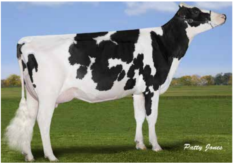
GEN-I-BEQ BOLTON SECRETLY 3.d. to Lot 15