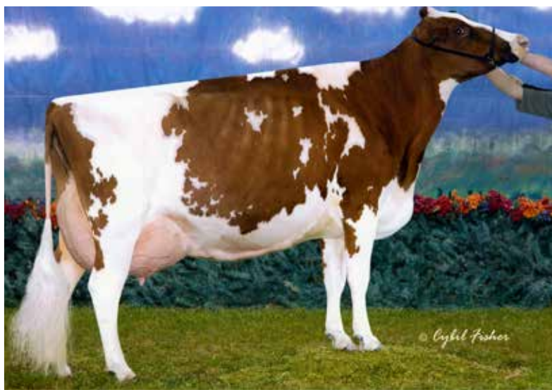
LAVENDER RUBY REDROSE PI EX96-2E 4.d. of Lot 26