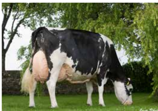
WARNELVIEW FINAL CUT NITA EX97-7E SP LP120 12* g.d. of Lot 44A