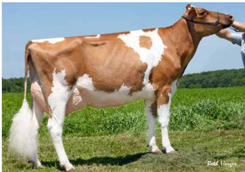
ROSEDALE ADVENTAEOUS RED EX92 3.d. of Lot 26