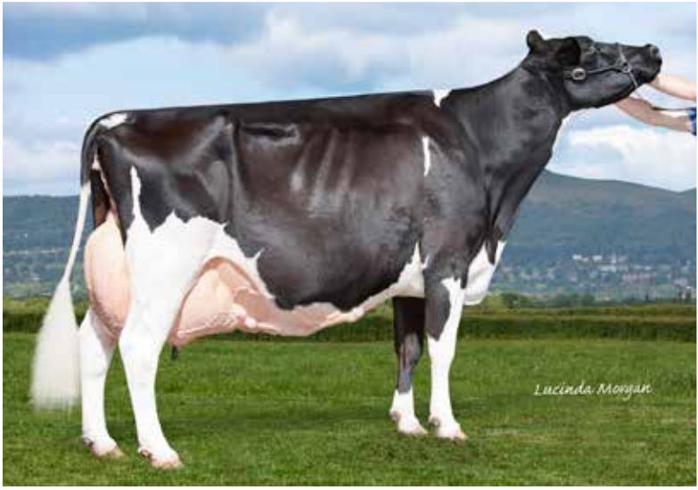
RICHAVEN RAIDER SQUAW EX97 dam of lot 32 & 32A