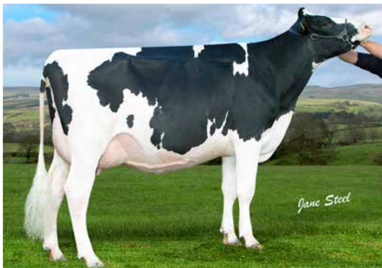
BOWBERHILL LOTA GREMLIN VG88