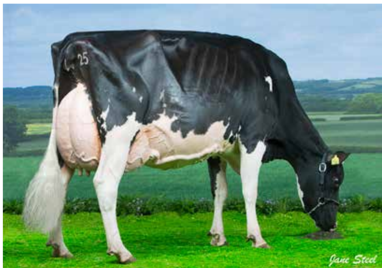
FEIZOR KNOWLEDGE S MELODY 3 EX94-2E SP LP80 7* g.d. of Lot 29