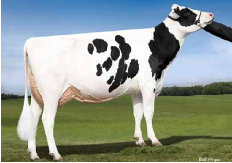
SANDY-VALLEY MG AMARETTO VG87 Dam to Lot 20