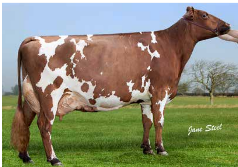
MARLEYCOTE SEA LILY 23 ET EX92-3E Dam of Lot 2