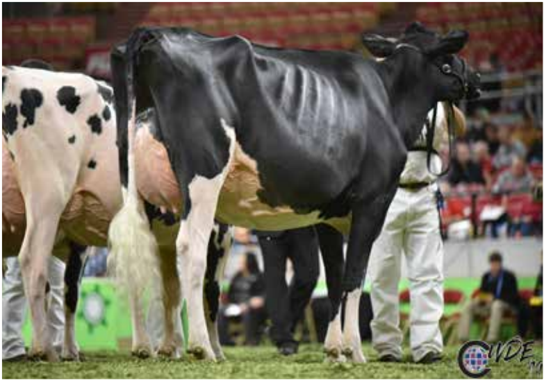
BUDJON VAIL SOLMN APACHE VG89 dam. of Lot 47