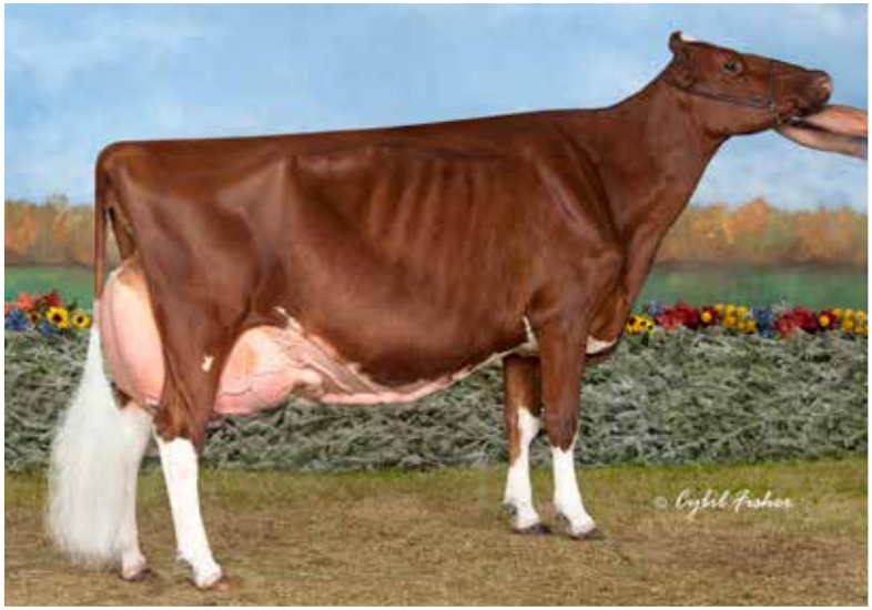
KHW REGIMENT APPLE RED EX96-3E DAM 32* LP100 4.d. of Lot 58