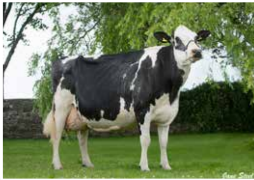
WARNELVIEW FINAL CUT NITA EX97-7E SP LP120 12* g.d. of Lot 44A