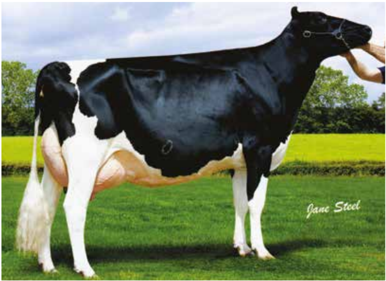
RICHAVEN GOLDWYN SQUAW EX96 maternal sister to lot 32 & 32A